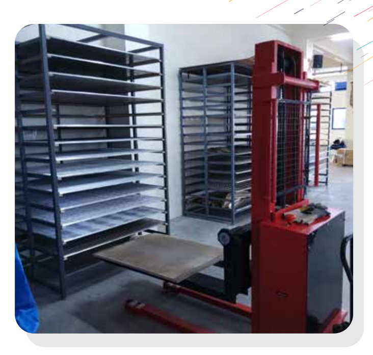
PLATES STORAGE AREA