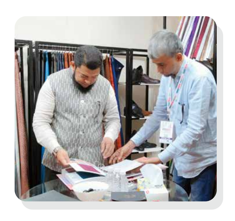
SHOETECH VELLORE 2022